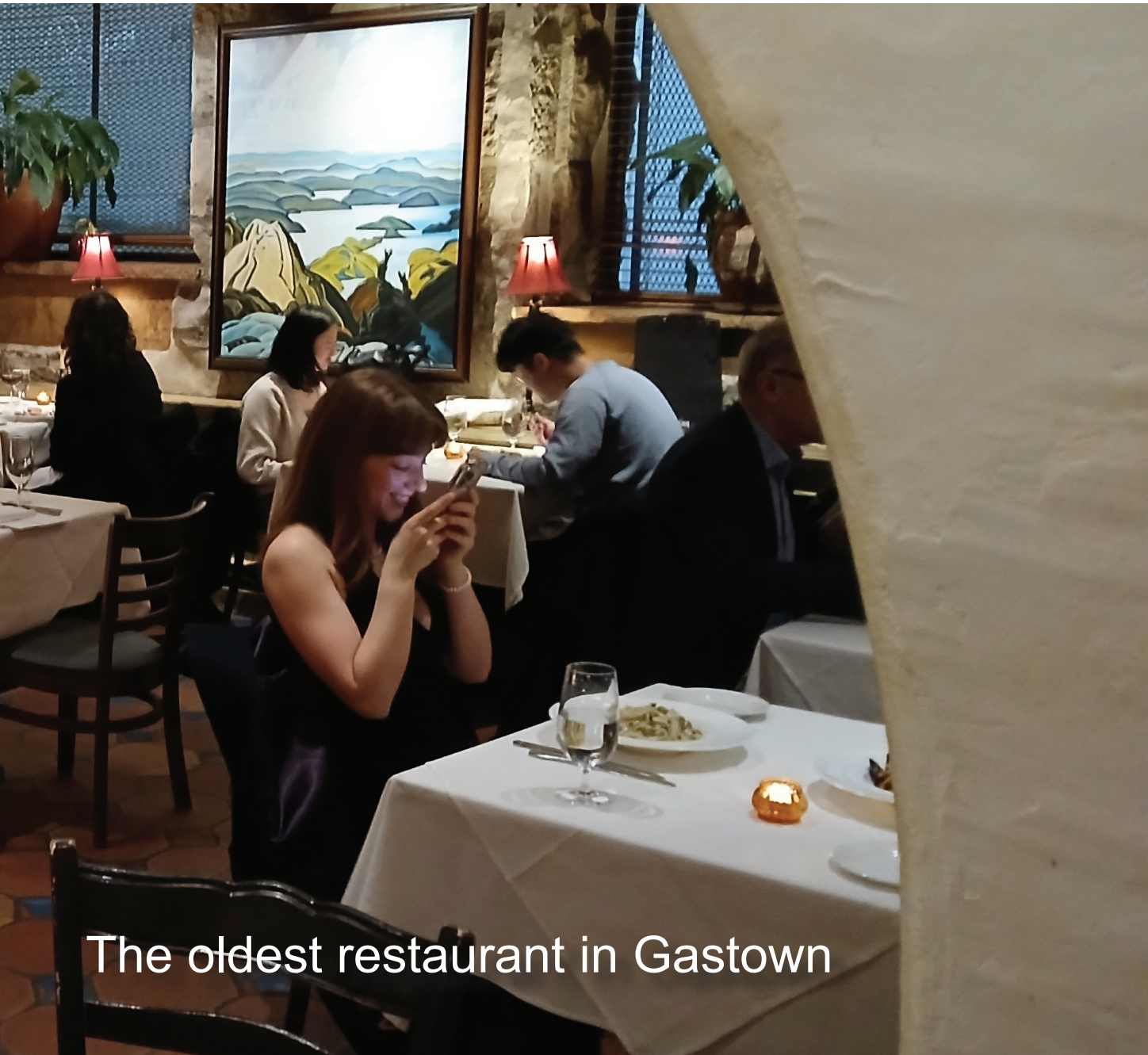
The oldest restaurant in Gastown